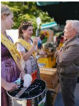
2019 Honey Queen explains natural honey processing

Visitors from Munich and the Germany enjoy to come, see, taste, learn about and buy the colourful variety of agriculture regional products.