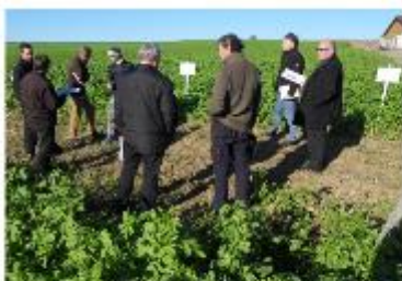
intensiver Austausch von Gemeinde , Landnutzern und Fachleuten anstatt sektoraler Fachplanung

Several examples of measures contributed to a good understanding of interventions.