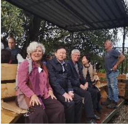
Tour on a tractor-vehicle