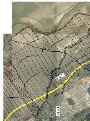
Right: after land consolidation