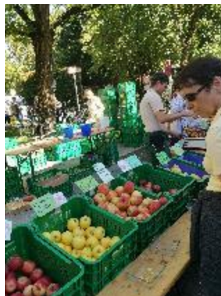
A visitor observes different varieties of apples