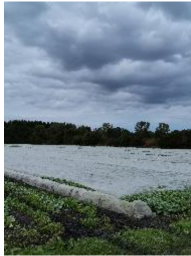
Field of radish under net